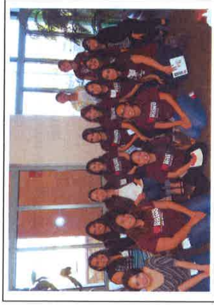
Educators Rising Conference 2016

Every teacher in America has the skills and experience to help all students achieve their potential.