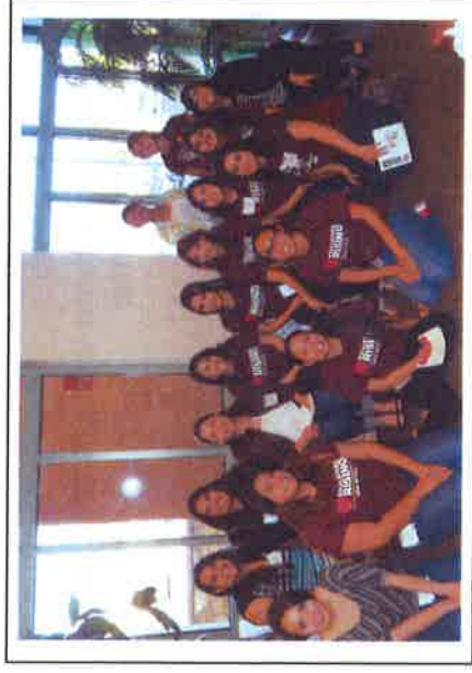
Educators Rising Conference 2016

Every teacher in America has the skills and experience to help all students achieve their potential.