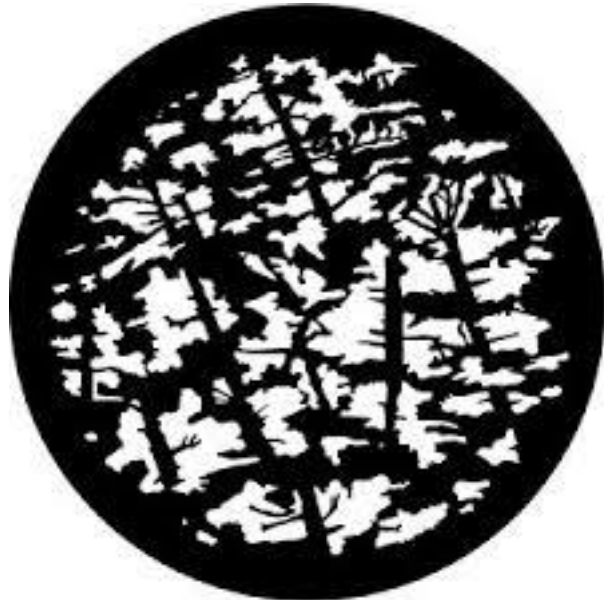
Pine Branches (out of focus to be breakup)

Scroller-roll colors- Frame 1=N/C (clear/no color), 2=R355 (pale violet), 3=R57 (lavender), 4=R357 (royal lavender), 5=R34 (flesh pink), 6=R337 (true pink), 7=R26 (light red), 8=R22 (deep amber), 9=R17 (light flame), 10=R13 (straw tint), 11=G470 (pale gold), 12=R88 (light green), 13=N/C (clear/no color), 14=L161 (slate blue), 15=R68 (sky blue), 16=R79 (bright blue)