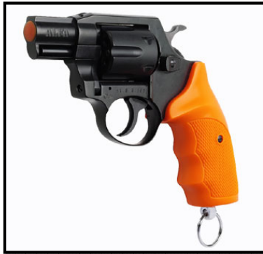
Sounding Device Closed Barrel