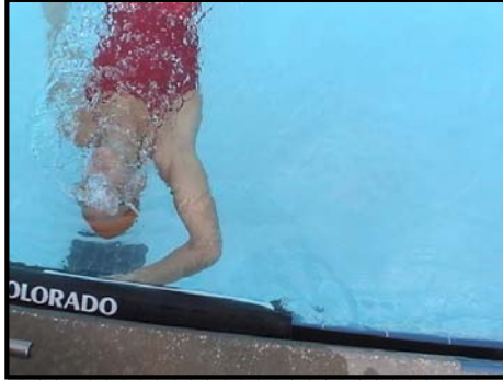
Pad in proper position