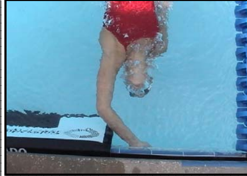
Pad moved out of proper position