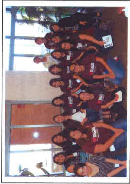
Educators Rising Conference 2016

Every teacher in America has the skills and experience to help all students achieve their potential.