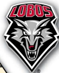
UNIVERSITY OF NEW MEXICO ATHLETIC EVENT PARKING GRID